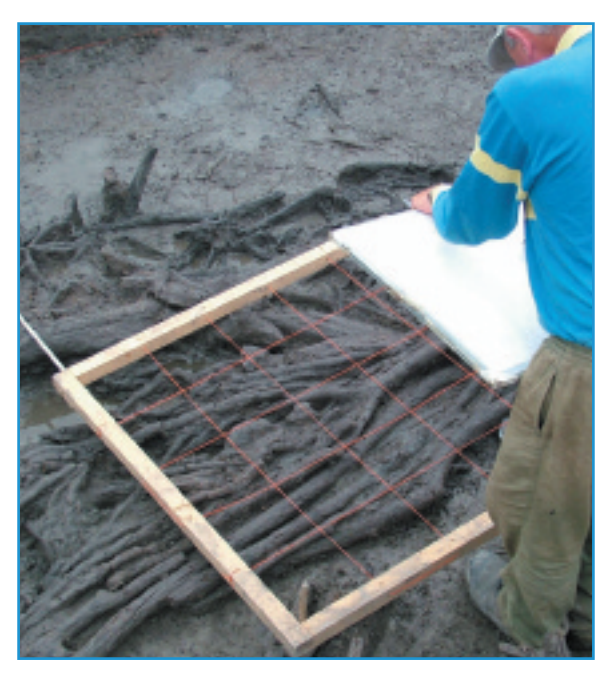
Archaeologist planning a Bronze Age trackway at Newrath, County Kilkenny, on the N25 Waterford City Bypass.

The primary form of information gathering in wetlands is by visual inspection of both surface and sub-surface conditions. The best method of sub-surface visual inspection is through trial trenching and test pitting. However, engineering boreholes, while not positioned from an archaeological viewpoint, are often key assessment tools at the early stages of a project and should be consulted.