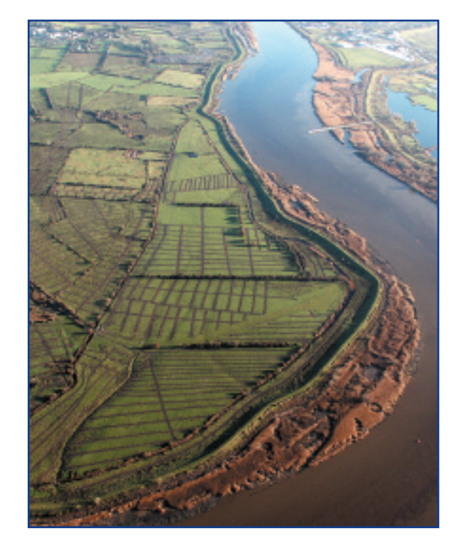
Backfilled test-trenches excavated along the route of the Limerick Southern Ring Road (Phase II) at Coonagh, County Limerick (TVAS (Ireland) Ltd)

This is particularly pertinent in areas of upland blanket bog where extensive archaeological landscapes have been discovered beneath the peat. (Note: all blanket bogs have been designated as Natural Heritage Sites.) While organic artefacts can be preserved in such environments, the majority of archaeological structures are stone-built (e.g. enclosures, huts, field walls, etc.). Wetland margins are also of high archaeological potential as locations on the edges of rivers, bogs, etc. provided a wide range of resources. It should be noted that the boundaries of these areas are likely to have altered significantly over time.