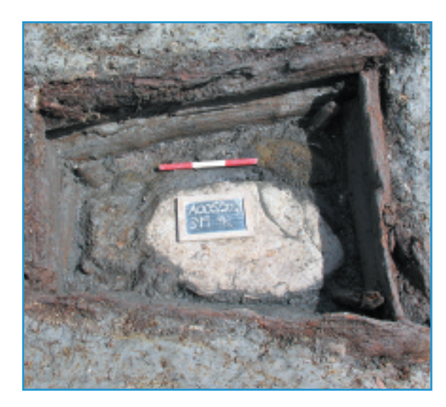
Wooden trough of a fulacht fiadh in alluvium excavated along the route of the Limerick Southern Ring Road (Phase II).

A significant issue in post-excavation relates to higher conservation costs, both for short-term curation and final conservation, given the potential for recovering large volumes of fragile, waterlogged organic remains. The provision of suitable working and storage facilities (with wet working areas, storage tanks, labelling and conservation facilities) will also have to be addressed.