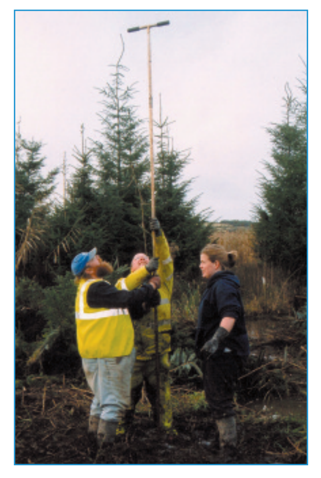
Environmental coring of a wetland area adjacent to the Hiberno-Scandinavian settlement at Woodstown, County Waterford, on the N25 Waterford City Bypass.

Having specialists in place proves cost effective as it: