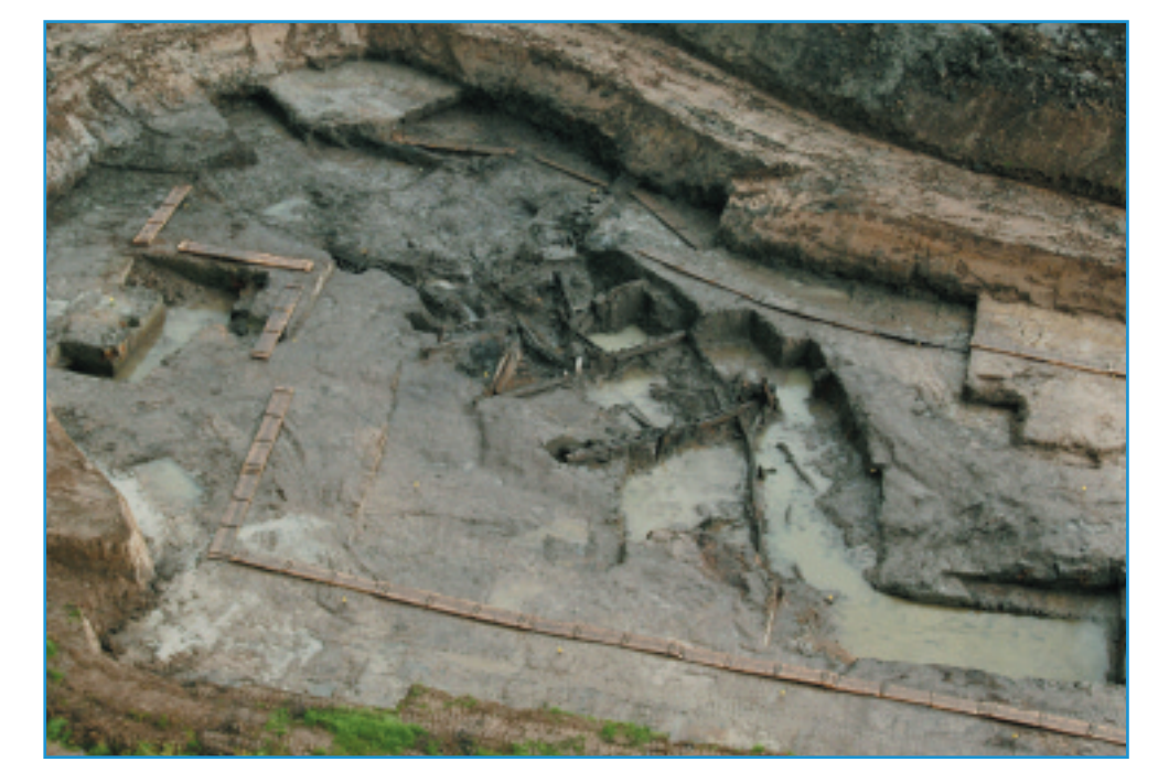
Aerial view of an early medieval vertical watermill discovered by test-trenching in alluvium at Killoteran, County Waterford, on the N25 Waterford City Bypass. (Studio Lab)

In advance of excavation, the presence of archaeological wood and other organic remains should be anticipated and suitable provisions made. A cohesive strategy of recording needs to be in place from the outset of the project, as major changes will affect the level of potential comparison between the results of earlier and later strategies. Standardised terminology should be agreed for sediments and natural deposits, joinery, timber conversions, etc., and be used consistently by all personnel. The use of pro-forma recording sheets is essential in this regard (e.g. timber sheets).