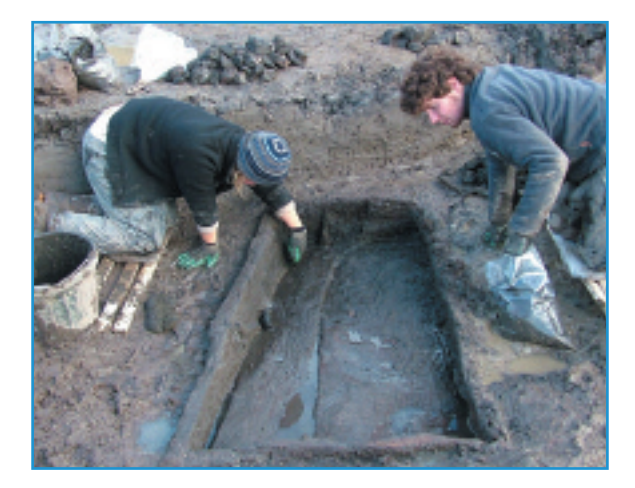
Archaeologists excavating the trough of a fulacht fiadh uncovered at Newrath County Kilkenny, on the N25 Waterford City Bypass.

As the basal deposits can flood almost immediately, excavated trenches must be recorded at speed. Generally, the timeframe for recording any archaeological material is considerably shorter than in dryland testing and, consequently, it is advisable that the testing team incorporates personnel experienced in the identification of wetland sites. For health and safety reasons personnel should not work alone, but operate with a form of wetland 'buddy system' (2-3 personnel minimum). In addition to the recording of the exposed material, dating and environmental samples may also be taken in selected cases. These samples, from recorded locations, should be taken in consultation with specialists as outlined below. These may be processed to aid in the dating or interpretation of uncovered archaeological material.