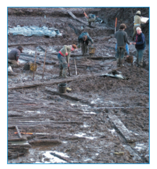
Archaeologists excavating a Bronze Age trackway uncovered at Newrath, County Kilkenny, on the N25 Waterford City Bypass.