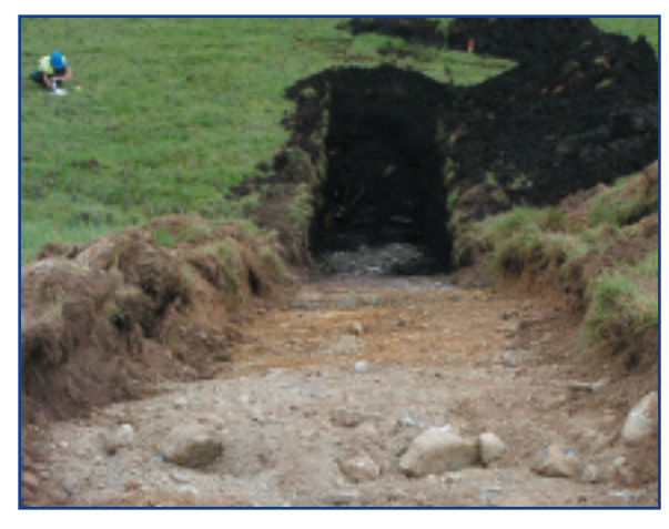
Conventional test-trenching at interface between dryland and peatland areas along the route of the N6 Kinnegad to Kilbeggan Road Scheme. (Cultural Resource Development Services Ltd.)

This natural stratigraphy is significant in terms of understanding the archaeological deposits. Specialist examination of such strata (e.g. collection and examination of cores, peat morphology studies, hydrological studies, analysis of insect remains, molluscs, plant remains, etc.) can provide valuable environmental information, which can be correlated to the archaeological evidence. However, difficulties may be encountered in working with the natural stratigraphy of wetland sites, in tracing archaeological layers or establishing stratigraphic relationships. This should also be taken into account when the Ordnance Datum (OD) level of sites is being considered. The constant change in water levels of estuarine and coastal areas and seasonal changes in peatland water tables can alter the level of archaeological sites in a short time. In addition, activities such as drainage can cause significant OD differences between related archaeological horizons.