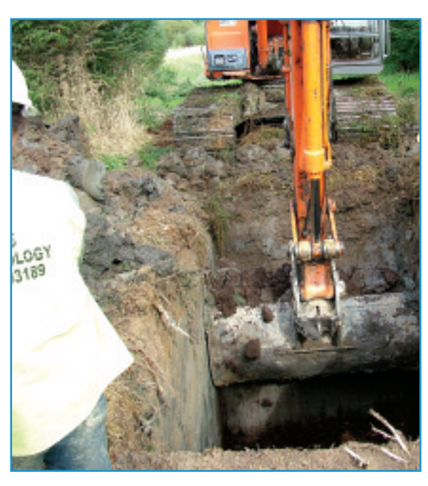
Archaeologist monitoring the excavation of a test pit in alluvium along the route of the Limerick Southern Ring Road (Phase II).

This information can then be used to generate general profiles through wetlands that will assist in devising an appropriate archaeological testing or mitigation strategy.